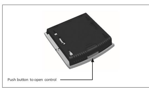
Fig. 3 - Back of RF Controller

2 orange flashes - Remote control reset carried out.