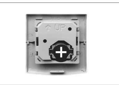
Fig. 4 - Battery holder